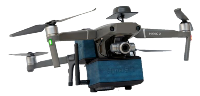
Figure 1. The HyperSlit system mounted on DJI Mavic 2 drone.

Several biometeorological studies have been conducted by HRS systems that are mounted on unmanned aerial vehicles (UAV)[5], [6]. This is because UAV based HRS systems are tempting due to their great degree of automation and fast throughput [7]. The recent development of small and lightweight UAVs such DJI Mavic series (e.g., diagonal size is less than 40cm and weight is less than 1kg) offer affordable (about 1000 $) and stable flying platforms for HRS systems. However, there is no small HRS system that fits these UAVs to collect PSS while recording sky spectra. Sky spectrum is dynamically changing because the atmospheric condition is constantly changing. This makes the calculation of reliable reflectance information from plants challenging [8], [9]. To address this, in this paper we present HyperSlit system solution (Figure 1).